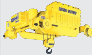
Top Running Trolley Hoist

Capacities of 1 to 25 tons. Long lifts up to 206 feet. High speeds up to 44 FPM.